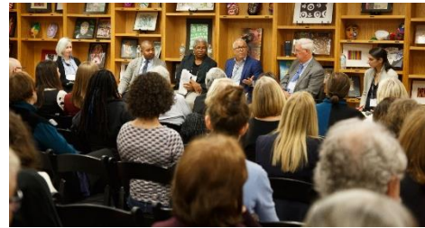
A roundtable on Responding to Community Needs Through Partnership.

On April 5 th the WilmerHale Legal Services Center celebrated their 40 th anniversary , commemorating their work meeting the community's legal needs, training the next generation of lawyers, and fostering social change.